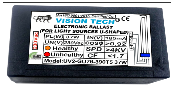
UV2 Dim. : LxBxH = 97mm x 46mm x 29mm